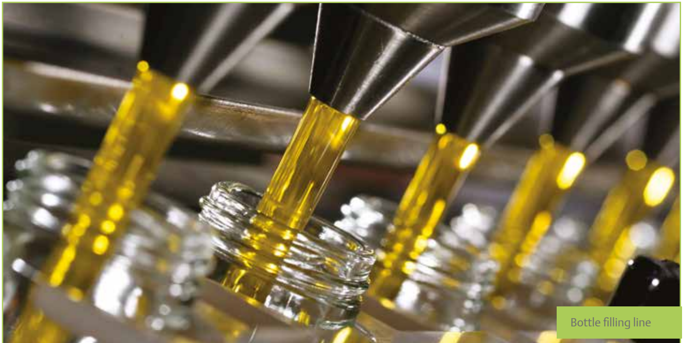
Bottle filling line