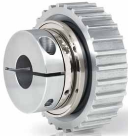
Timing belt or chain sprocket only included upon request.