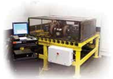
State-of-the-art testing equipment and comprehensive product testing ensures quality.