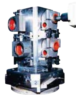
A multi-pallet machining center machines precisely and efficiently.