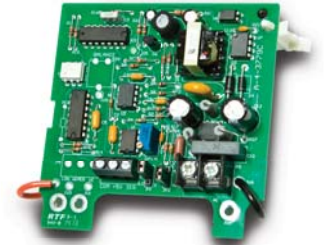
-55H2 option board